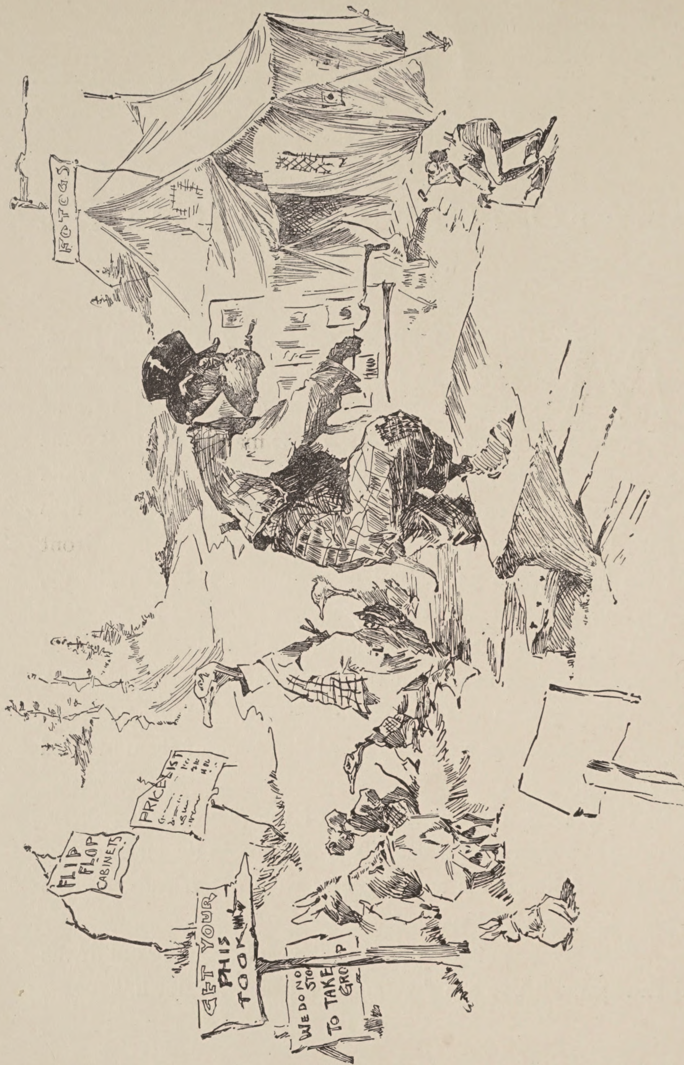
UGLY DOG TELLS THE ANIMALS TO STEP IN.